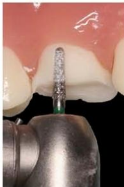
Axial Wall Reduction